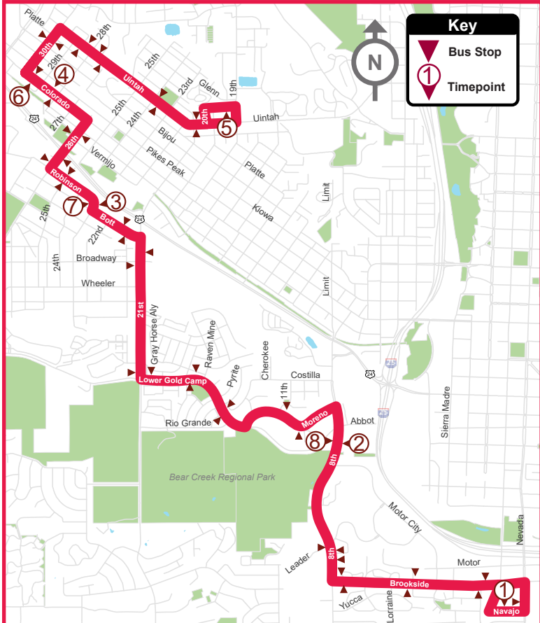
Numbers on map correspond to numbers on schedules.