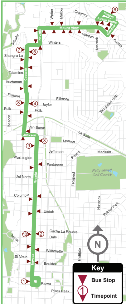
Numbers on map correspond to numbers on schedules.