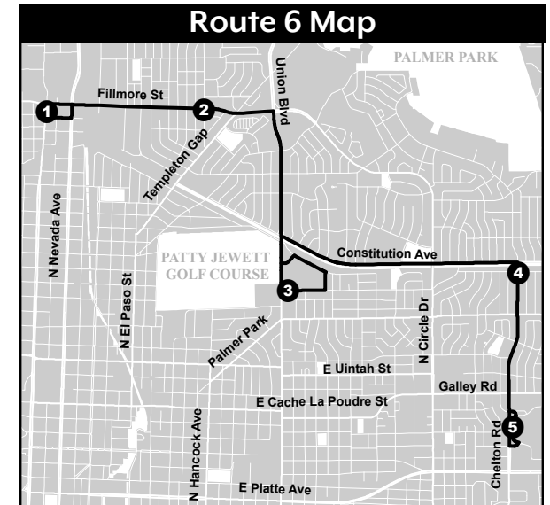
Numbers on map correspond to numbers on schedules. Additional stops are located between timepoints.

For the most current route and schedule information, use My Next Bus real-time estimates with your phone, call 385-RIDE (7433), or visit mmtransit.com.