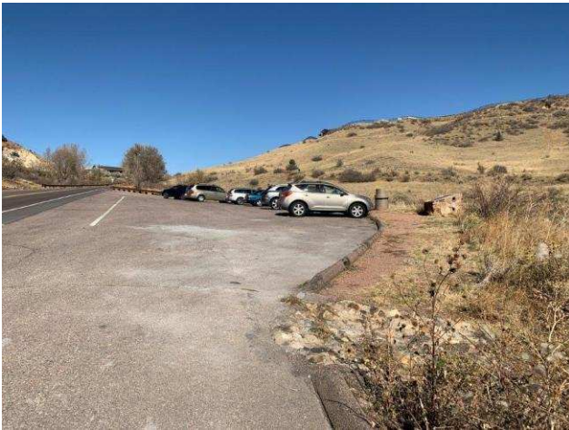
Finding 187785 Main Photo