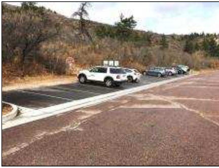
Finding 187785 Additional Photo