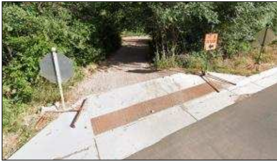
Finding 190271 Additional Photo