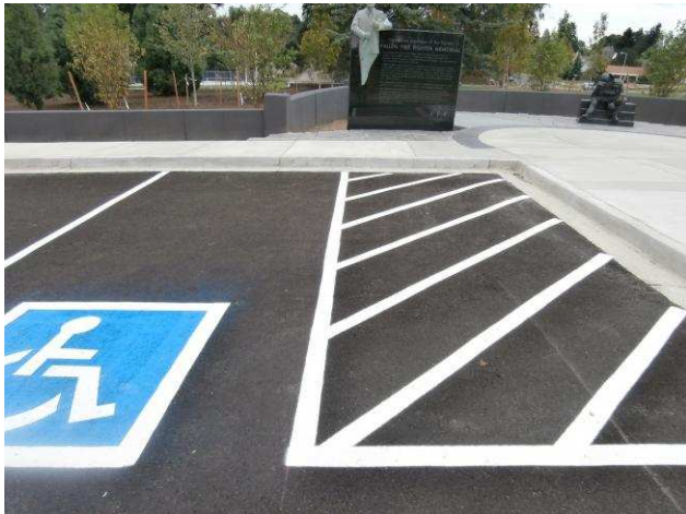
Image of access aisle with excessive cross slope