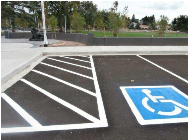
Image of access aisle with excessive cross slope