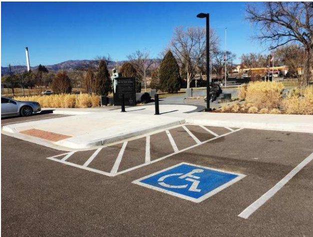
Image of accessible parking without signage