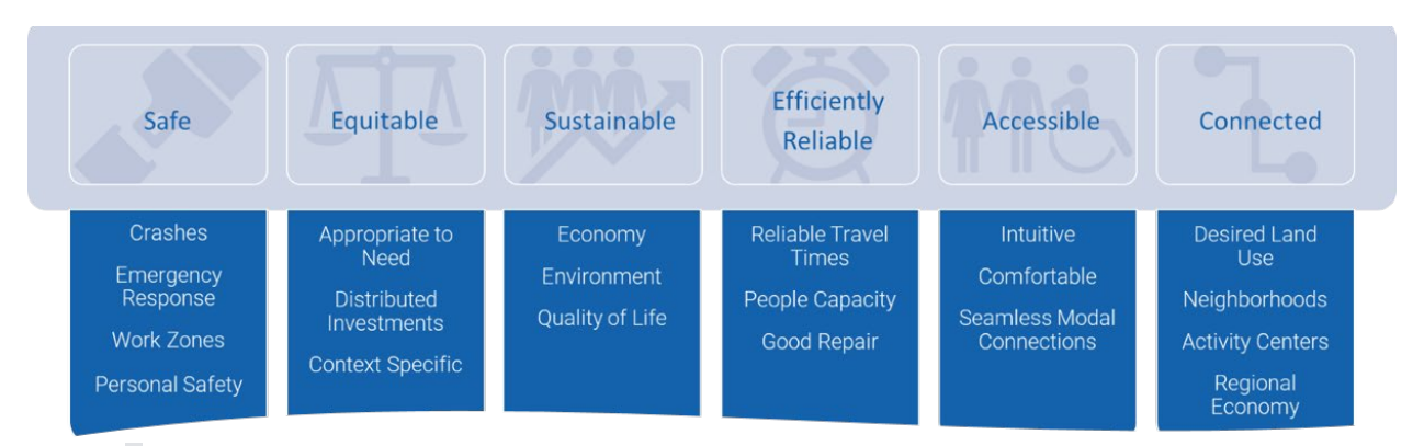
Figure 1: The ConnectCOS Goal Framework

Ted Ritschard (Olsson) provides a summary of the ConnectCOS process. Based on the guiding themes of PlanCOS and the transportation investment priorities, the draft ConnectCOS Plan is based on a six-goal framework (Figure 1). This planning effort aims to serve the people & community, be resource stewards, and remain consistent with PlanCOS.