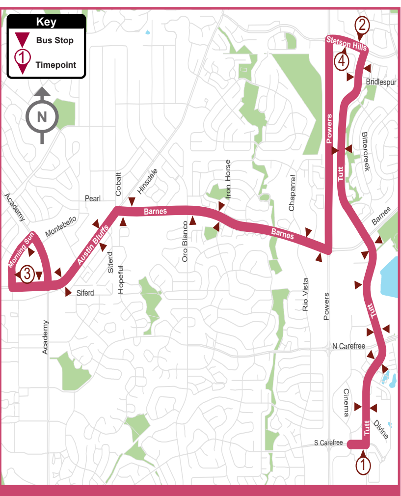
Numbers on map correspond to numbers on schedules.