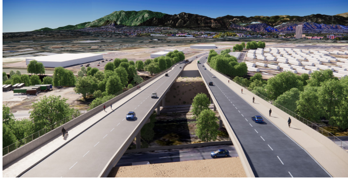
Above: a rendering of the completed project with new bridges, pedestrian and bicycle access.