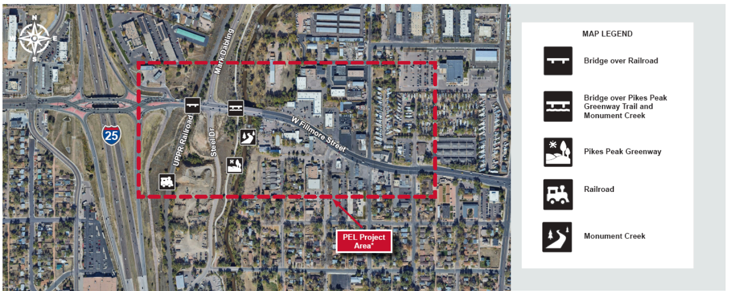
* Limits of project area to be refined during the PEL process and project

The Fillmore Street Bridge Improvements and Trail Connections - I-25 to Monument Creek Project (Fillmore Bridge Project) is evaluating the deteriorating bridges on Fillmore Street over Monument Creek, the Pikes Peak Greenway Trail, and the Union Pacific Railroad. The project seeks to improve vehicular congestion and multimodal safety along Fillmore Street, as well as provide trail connection(s) to the Pikes Peak Greenway Trail.