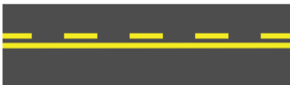
Non-Movement Area Boundary NEVER cross while driving a vehicle

D – This endorsement allows you to operate a vehicle within the AOA non-movement areas with a valid driver’s license.