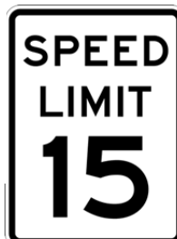
Inside the AOA