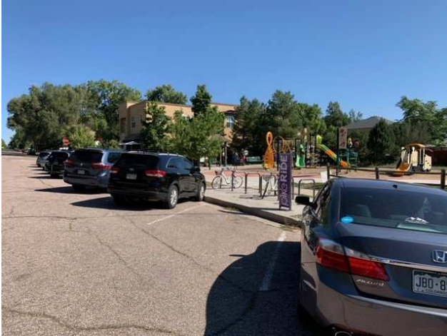
Table R214 On-Street Parking Spaces